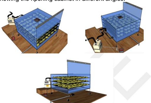
Fig. 1. Ripening Cabinet

Glass material is used as it helps to observe inside of the cabinet. But as the cost is high, other suitable material such as stainless steel can be used with only a one glass side. Fig. 1 is showing the ripening cabinet in different angles.