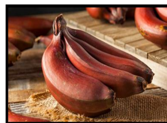
Fig. 4. Green Banana

These are even sweeter and softer than Cavendish banana. Have a reddish purple peel. When ripen the skin will be lighter (light pink). It contains more beta carotene and vitamin C than other types (Fig. 4). Origin- South East Asia.