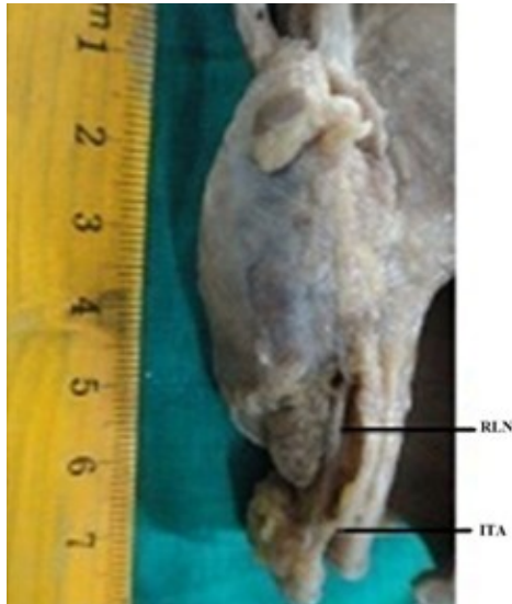
Fig. 2: Posterior view of thyroid showing RLN passes anterior to ITA (Type B) Entering pattern.

It was noted that main trunk of ITA entered either into middle 1/3 rd or lower 1/3 rd of the thyroid lobe. A total of 63.7% of ITA in male and 69.44% in female entered into the posterior aspect of middle 1/3 rd of thyroid lobe and 36.27% in male and 30.55% in female entered into lower 1/3 rd of thyroid lobe in both genders of Sri Lankan population. Entering pattern is more or less similar in both genders (Table 3 & 4).